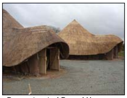
Reconstructed Round House

Iron Age Celts lived in houses – but they were very different to the houses we live in today! Large families lived in a roundhouse. The walls were made of daub (straw, mud, and tail) and the roof of straw.