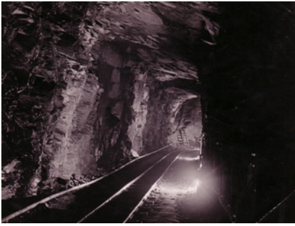
The main approach tunnel to the cavern

When London was faced, in 1940, with intensive bombing by the Luftwaffe every night, Prime Minister Churchill was concerned about the safety of the many British art treasures and he ordered them moved from museums and art galleries in London.