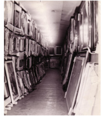
Paintings from the National Gallery stored in Manod Quarry

Gallery were transported to north Wales (including 19 Rembrandts, Van Dykes, Leonardo da Vincis together with the Crown Jewels.